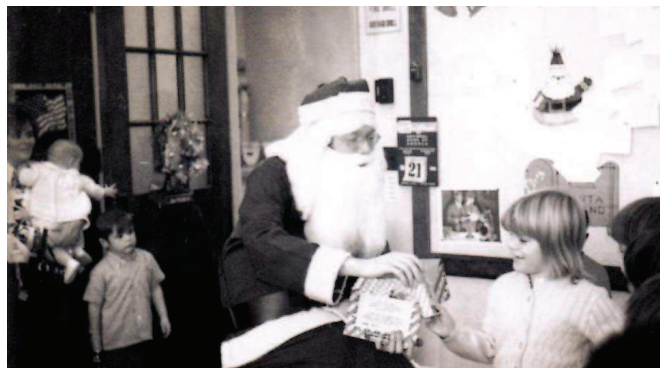
Santa visits the Farnham School

December The Brant-Farnham Historical Society advertised a request for submissions of "Santa and Me" photos. None were submitted, however we did find some in our archives.