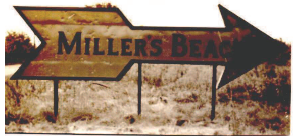
Miller's Beach sign, once located on Old Lake Shore Road, points "this way to the beach"!