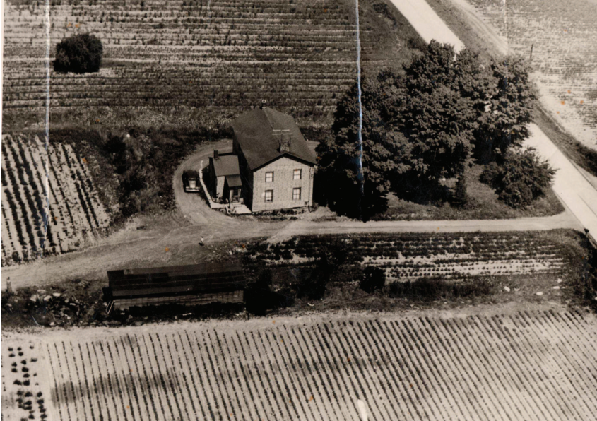
Photo of 10906 Mileblock Road (at end of Halley Rd. ) taken in late 1950's.