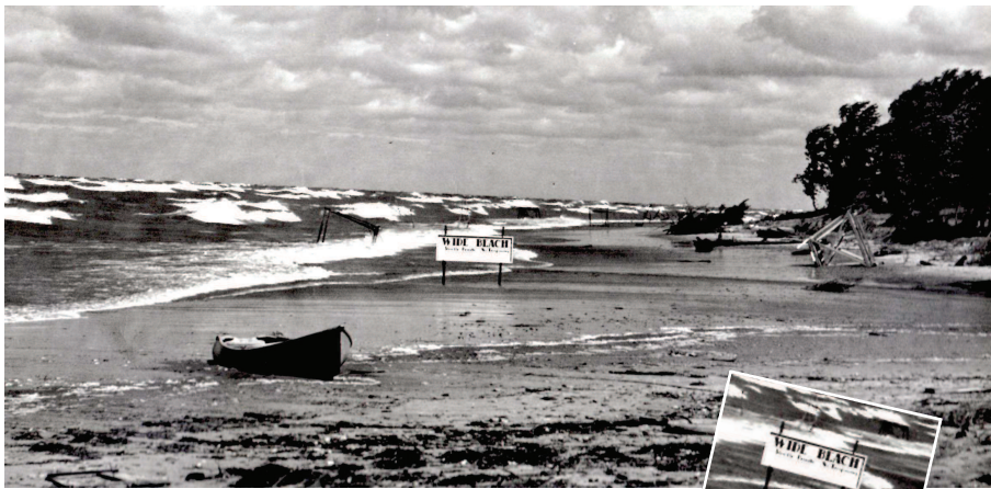
Wide Beach sign as seen from Miller's Beach