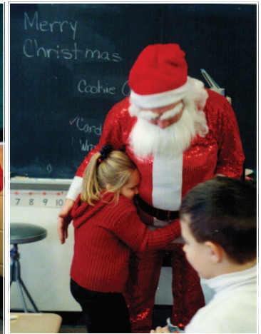
A Hug for Santa at the Brant 1 School 2005