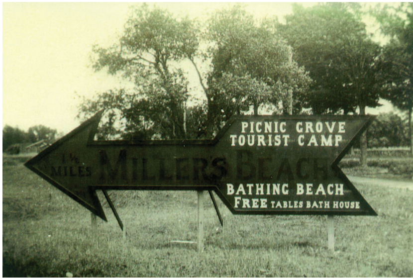
Miller's Beach sign, once located (we believe) at Rt.5 near Farnham Water Tower, pointing toward the Old Lake Shore Road