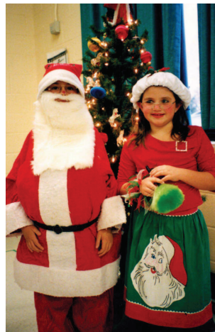
Mr. and Mrs. Claus at the Brant 1 School 2004