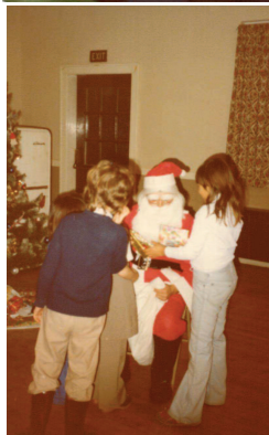
Meeting Santa at the Farnham Fire Hall