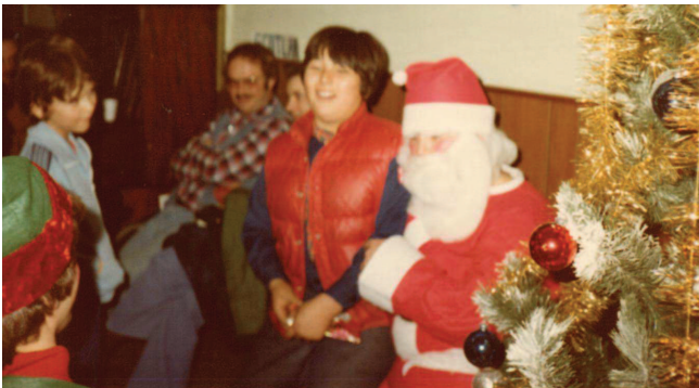
Above: Members and family of Cub Scout Troop 398 meet Santa at Holy Cross Lutheran Church in Farnham