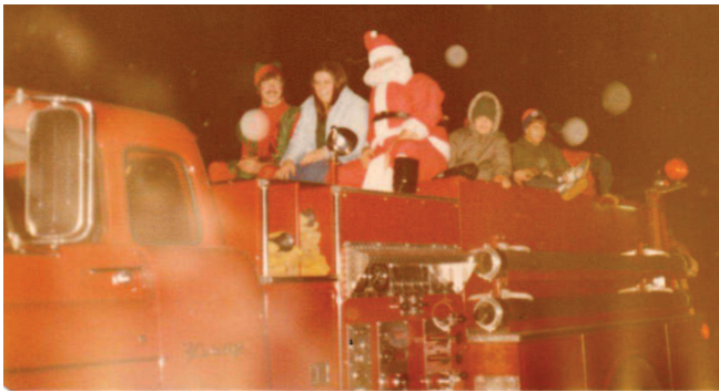
Santa on Farnham Fire Truck