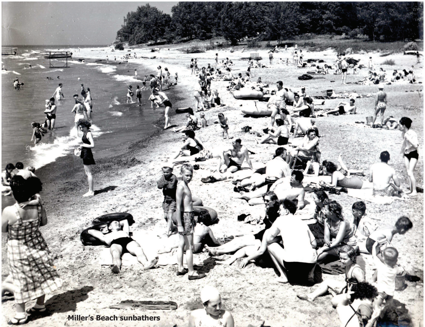
Miller's Beach sunbathers