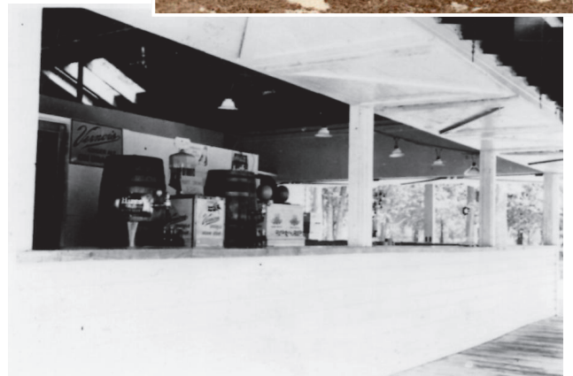
Miller's Beach Stand - June 24, 1926